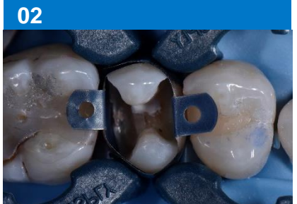
Palodent V3 sectional matrix set-up showing re-creation of ideal line angle anatomy all in one solution.