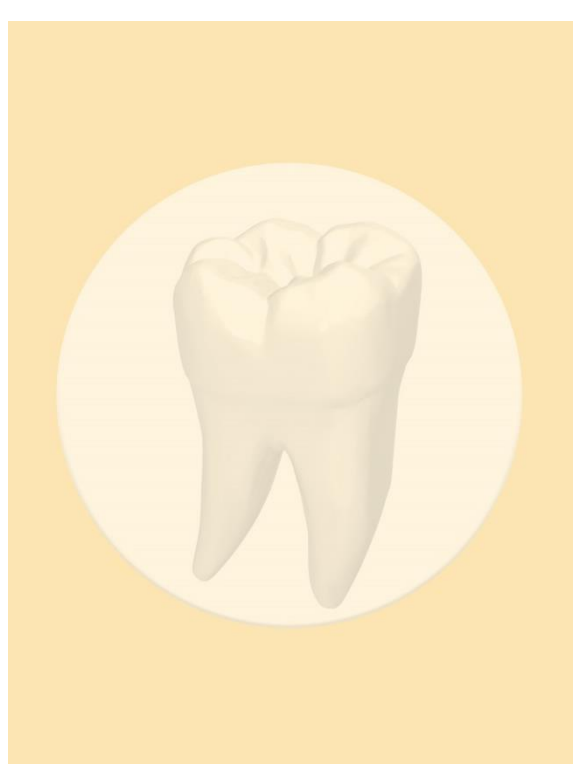
Product Name + Generics (untertitle) or logo

Following the total etch bonding technique, Dentsply Sirona SDR was placed against the base of the proximal box floor as liner in very thin layers and cured, in an effort to ensure hybridization and marginal integrity in this sensitive area before building the marginal ridge. The body composite chosen, Dentsply ceram-x universal, features SphereTEC technology using spray granulation to produce spheres with a mean size of 15 µm out of primary submicron filler glass. These spheres minimize frictional forces when under stress. On the other side the irregularly shaped primary particles ensure high slump resistance, thus leading to excellent sculptability. The Cloud Shading Concept adopted by Dentsply ceram-x universal allows a single shade to umbrella a cluster of shades, by its distinct chameleon effect, permitting a minimalized armamentarium. The Palodent V3 matrix permitted efficient reconstruction and placement of initial layers in the extended proximal box situation, obviating the need to free-hand sculpt line angles prior to placement of the sectional matrix assembly. All in all, the Class II Solution offered by Dentsply Sirona is elegant, efficient and precise; three features I strive to achieve in every restoration.