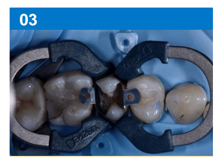
Zoomed out view showing diametrically-opposing Palodent V3 rings with EZ Coat matrices overlapping each other in a one-step solution driving the rebuilding of proximal and axial contours predictably.