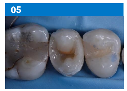
Buccal lobe placement using A2 Ceram-X. Fissure stain placed in interlobar position.