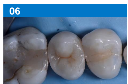
Final result after placement of lingual lobe and characterization. This result demonstrates the superb handling, sculpt-ability and chameleon effect of the universal, cloud-shaded Ceram-X composite featuring spherical fillers for ultimate control of placement. Note the precision of line angle and bucco-lingual embrasure formation with Palodent V3.