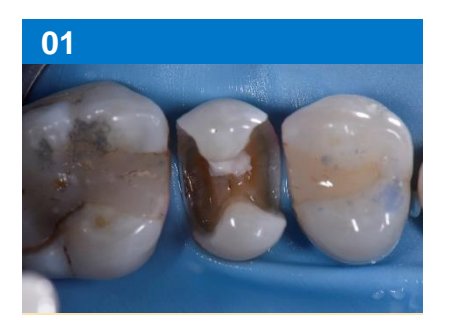
Intraoperative situation showing extent of large MODL Class II restoration. Resin-modified calcium silicate liner placed against area of deeper dentin with near-carious pulp exposure. Wedgeguards will protect against accident adjacent tooth grazing during preparation, and also double as the wedge for your Palodent V3 sectional matrix assembly.