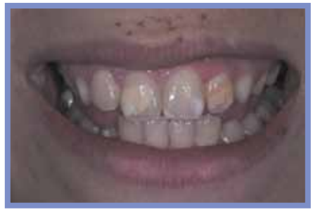
Fig. 1 Cohen's baseline smile

"The cases that strike my heart the most are cases involving kids that suffer a loss of confidence due to teasing of their appearance. The cases that are most special to me are not those where I can do my planning, execution or my layering prowess, but rather those in which minimal tissue or tooth reduction is needed. Cases that truly embody non-invasive dentistry just like Cohen's case wherein overnight vital bleaching using custom cervical trays and microabrasion before resin infiltration. Aside from the success of the minimally invasive procedure done, I think the best result was Cohen not being teased in school anymore," explained Dr. Tam.