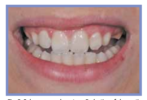
Fig. 5: Cohen one week post-op: Reduction of chromatic and white hypomineralisation.